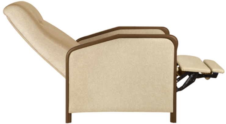
Model: 880102 29.5W 33D 43H 23SW 20.5SD 19SH 26AH

Specifically designed for acute care patient and treatment rooms, the Acute Momentum line with gentle contours and generous cushions provide stress-reducing comfort for patients. Cleanout is available with no engineering required. For added comfort, an optional soothing heat and light massage function is available on recliners.